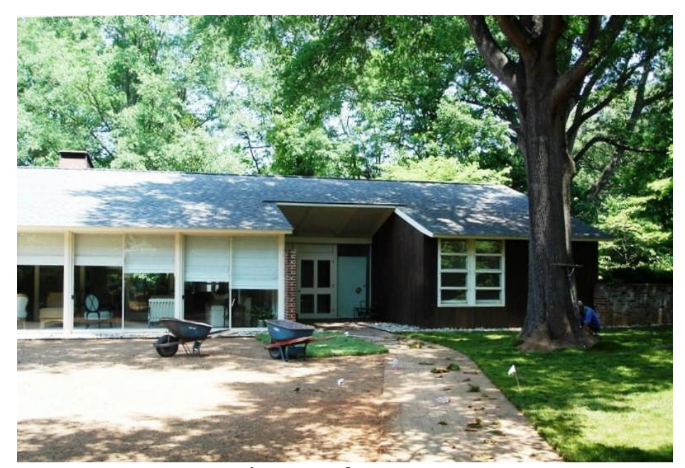
Façade view, front entrance

Greensboro, Guilford County, GF4960, Listed 8/13/2008 Nomination by Cynthia de Miranda Photographs by Cynthia de Miranda, May 2007